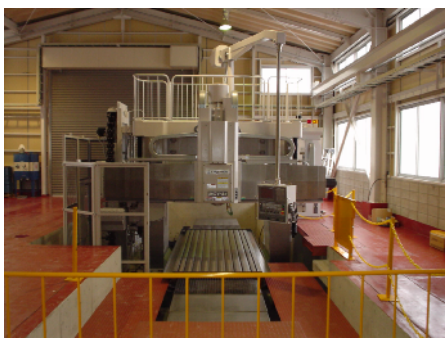
High-performance machine tools

Its feature is to product precision dies by its high-precision forming technology which has been developed in manufacturing kitchen sinks. The precision toolings are produced by using high-performance machine tools such as CAD/CAM, CNC and grinding machine. Another feature is the capability of verifying the completeness of each part internally in short term by the introduction of 1,000-ton press machine for trial. It enables us to meet the needs of short-term delivery and gain the trust of users on quality.