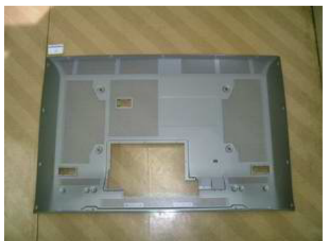
The rear cover for flat-screen TV stamped by the built die