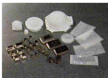
Various kinds of infrared sensors and optical accessories

Infrared ray sensors are used not only in security, but also in home appliances products such as microwave oven and air-conditioner, in medical products such as thermometer and in other various kinds of aspects that is closely linked to our life. Its sensors by the ceramic technology of year's experience are highly evaluated in the world and its more developments are expected.