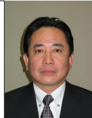
Hikaru Koike President

The company manufactures lithium tantalate and quartz wafers used for substrates for filters to control the electrical signals to be communicated by mobile telephones and for video equipment and for the keyless entry of automobiles. In those wafers, the company has a world share of more than 40%.