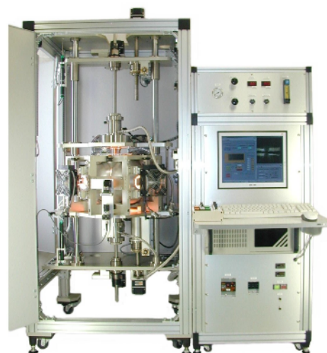
Remotely controlled from anywhere in the world and at any time