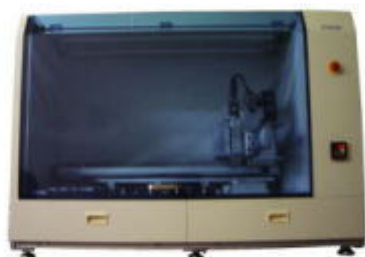
Microarrayer for DNA/Antibody/Protein