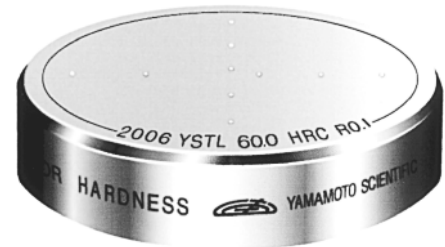
High-precision standard blocks for hardness

Yamamoto's standard blocks with excellent uniform hardness have been practically used as the global standard: ISO standards have adopted the blocks as the common standards for hardness evaluation.