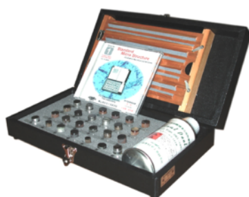
Standard blocks for microstructure

In the laboratory in Chiba, Japan, 20 workers of Yamamoto have been manufacturing standards blocks adopted worldwide for hardness tests applicable from bottle caps to metal strength of airplane. With supports from its various partners, now Yamamoto has been developing standard blocks for nanoindentation hardness test, as well as standard blocks for microstructure (Group 7: abnormal microstructure).